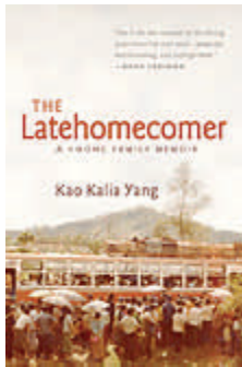
The Latehomecomer: A Hmong Family Memoir By Kao Kalia Yang